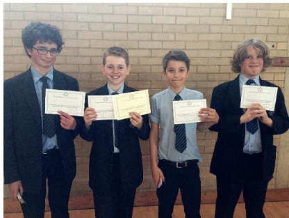
UK Maths Challenge Regional Finalists 2014

Rotary Club Creative Writing Competition