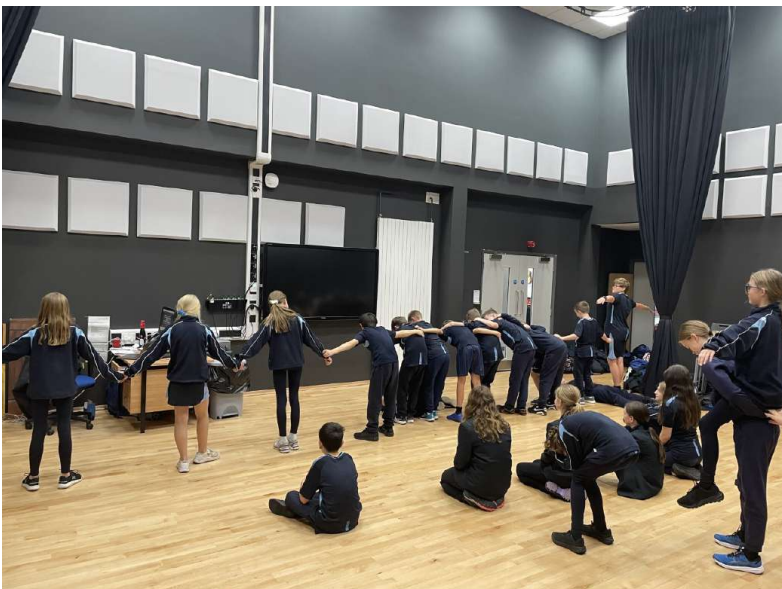
Year 7 girls' first taste of physical theatre